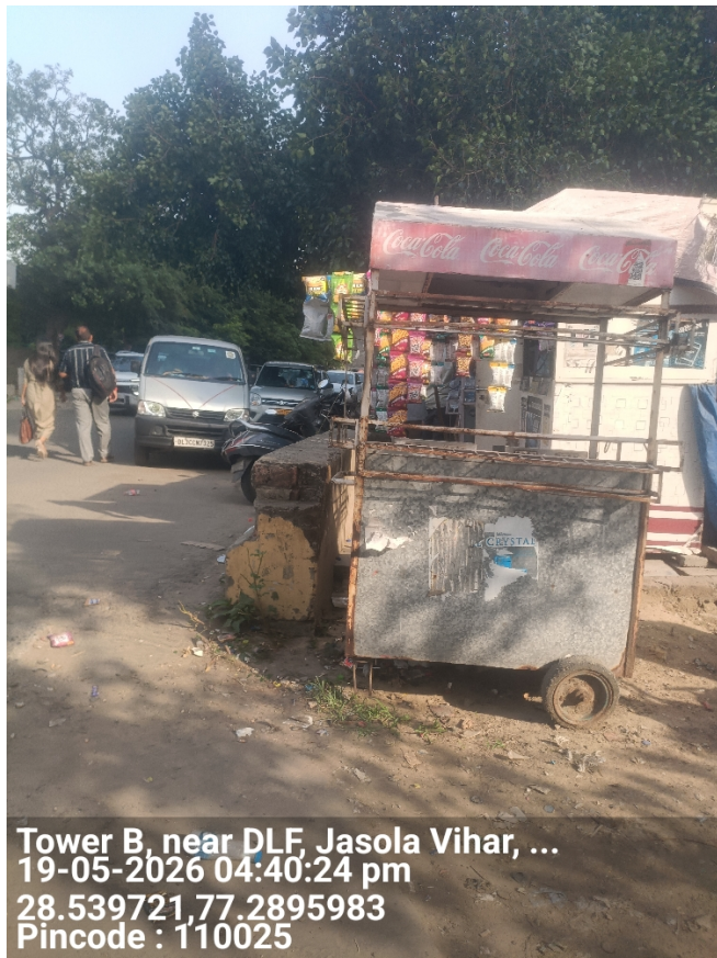
Tower B, near DLF, Jasola Vihar, ... 19-05-2026 04:40:24 pm 28.539721,77.2895983 Pincode : 110025

Shop front photo with full vertical viewpoint i.e; shop board, sealing, entrance, ground on which the shop is established (cemented, pilers, bricks, stands, mud, wheels etc.)