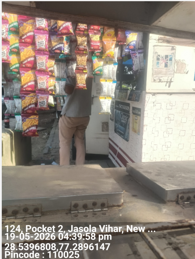
124, Pocket 2, Jasola Vihar, New ... 19-05-2026 04:39:58 pm 28.5396808,77.2896147 Pincode : 110025

Take Photo of Person Met Inside the Shop