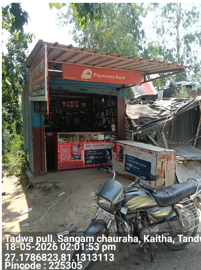
Tadwa pull, Sangam chauraha, Kaitha, Tandw 18-05-2026 02:01:53 pm 27.1786823,81.1313113 Pincode : 225305

Shop front photo with full vertical viewpoint i.e; shop board, sealing, entrance, ground on which the shop is established (cemented, pilers, bricks, stands, mud, wheels etc.)