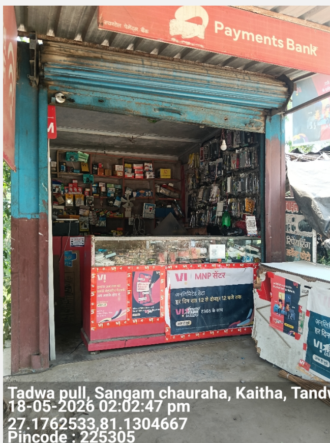
Tadwa pull, Sangam chauraha, Kaitha, Tandw 18-05-2026 02:02:47 pm 27.1762533,81.1304667 Pincode : 225305

Take Photo of Person Met Inside the Shop