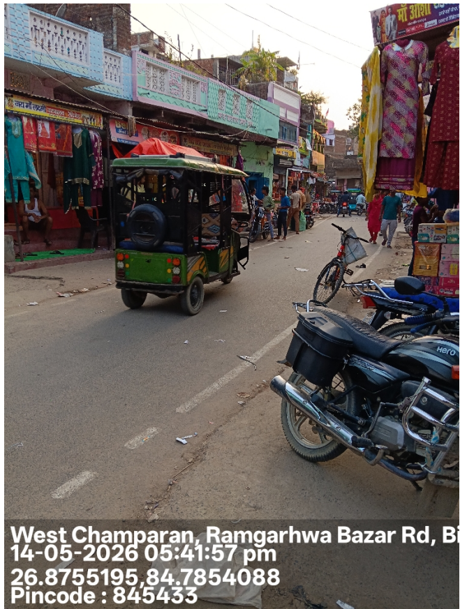
West Champaran, Ramgarhwa Bazar Rd, B 14-05-2026 05:41:57 pm 26.8755195,84.7854088 Pincode : 845433

Shop front photo with full vertical viewpoint i.e; shop board, sealing, entrance, ground on which the shop is established (cemented, pilers, bricks, stands, mud, wheels etc.)