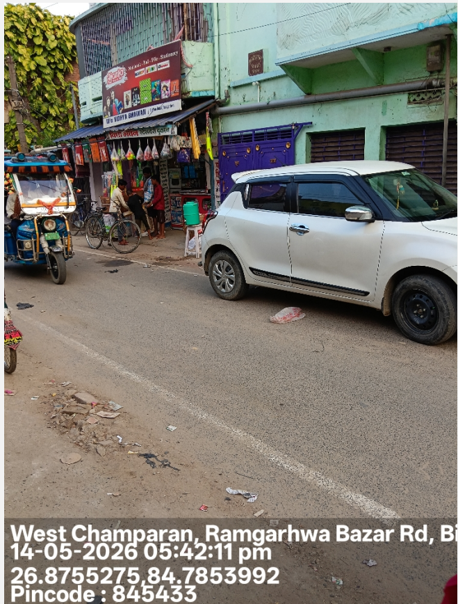
West Champaran, Ramgarhwa Bazar Rd, B 14-05-2026 05:42:11 pm 26.8755275,84.7853992 Pincode : 845433

Take Photo of Person Met Inside the Shop