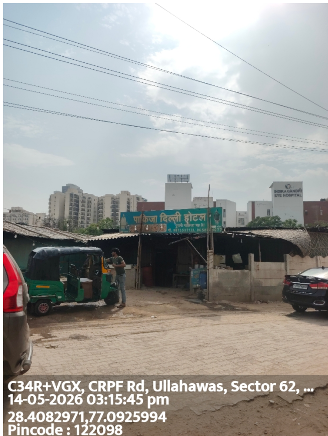
C34R+VGX, CRPF Rd, Ullahawas, Sector 62, ... 14-05-2026 03:15:45 pm 28.4082971,77.0925994 Pincode : 122098

Shop inside with inventory photos establishing that the inside is of the same shop where the front photo was taken