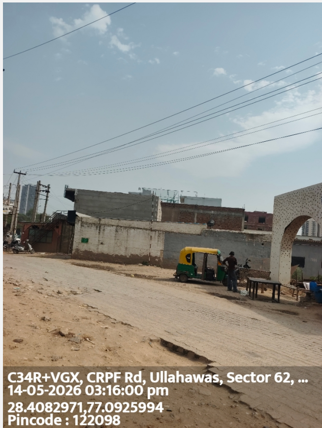
C34R+VGX, CRPF Rd, Ullahawas, Sector 62, ... 14-05-2026 03:16:00 pm 28.4082971,77.0925994 Pincode : 122098

Shop front with horizontal view covering the left & right of the shop establishing if the shop is an individual structure, in a marketplace, highway, isolated place, in a cluster framework.