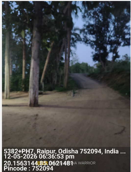
Photo with Agent