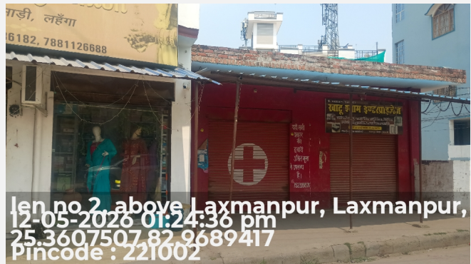
Photo of Outside Shop