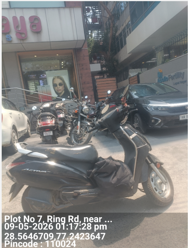
Plot No 7, Ring Rd, near ... 09-05-2026 01:17:28 pm 28.5646709,77.2423647 Pincode : 110024

Take Photo of Person Met Inside the Shop