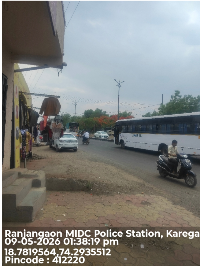
Ranjangaon MIDC Police Station, Karegaon 09-05-2026 01:38:19 pm 18.7819564,74.2935512 Pincode : 412220

Shop inside with inventory photos establishing that the inside is of the same shop where the front photo was taken