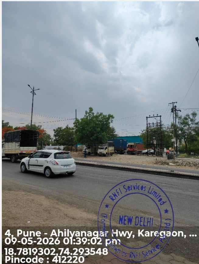
4, Pune - Ahilyanagar Hwy, Karegaon, ... 09-05-2026 01:39:02 pm 18.7819302,74.293548 Pincode : 412220