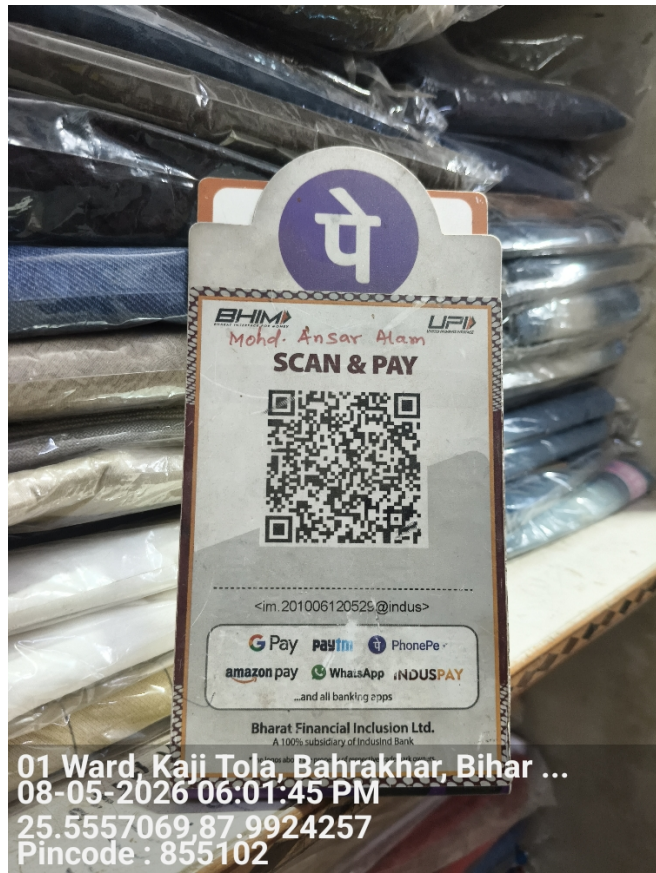
Photo with UPI Scanner