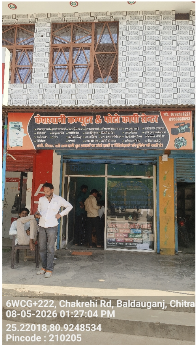
Shop Photo with Business Board