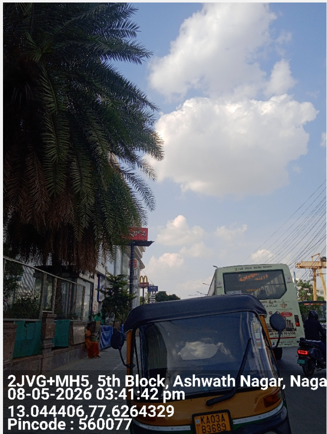
2JVG+MH5, 5th Block, Ashwath Nagar, Naga 08-05-2026 03:41:42 pm 13.044406,77.6264329 Pincode : 560077

Shop front with horizontal view covering the left & right of the shop establishing if the shop is an individual structure, in a marketplace, highway, isolated place, in a cluster framework.