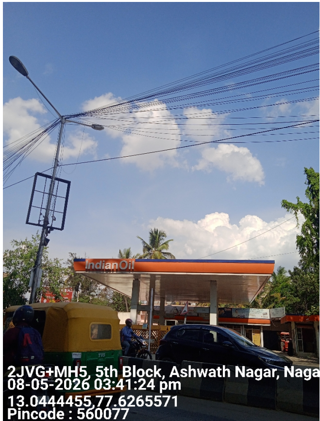
2JVG+MH5, 5th Block, Ashwath Nagar, Naga 08-05-2026 03:41:24 pm 13.0444455,77.6265571 Pincode : 560077

Shop inside with inventory photos establishing that the inside is of the same shop where the front photo was taken