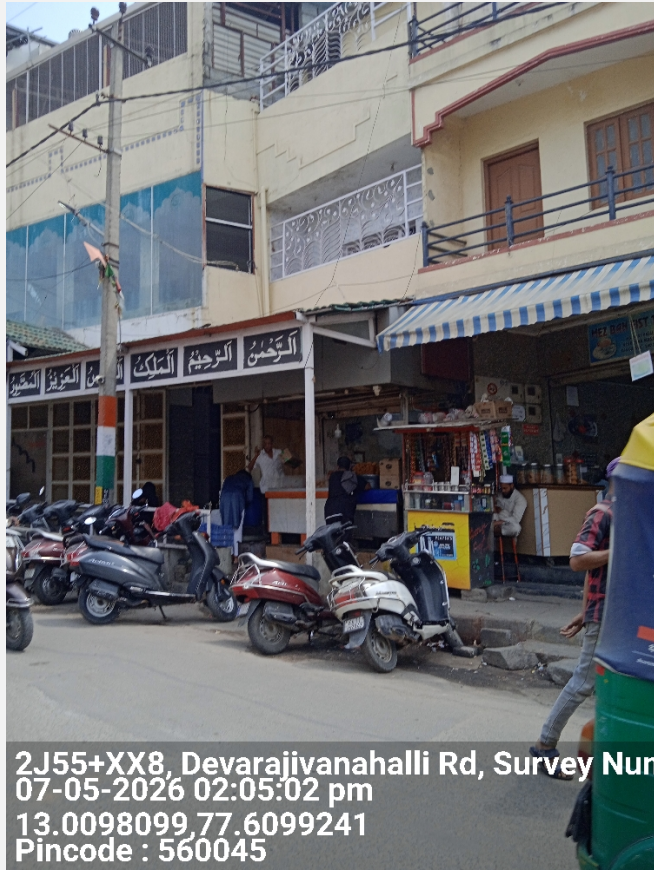
2J55+XX8, Devarajivanahalli Rd, Survey Num 07-05-2026 02:05:02 pm 13.0098099,77.6099241 Pincode : 560045

Shop front with horizontal view covering the left & right of the shop establishing if the shop is an individual structure, in a marketplace, highway, isolated place, in a cluster framework.