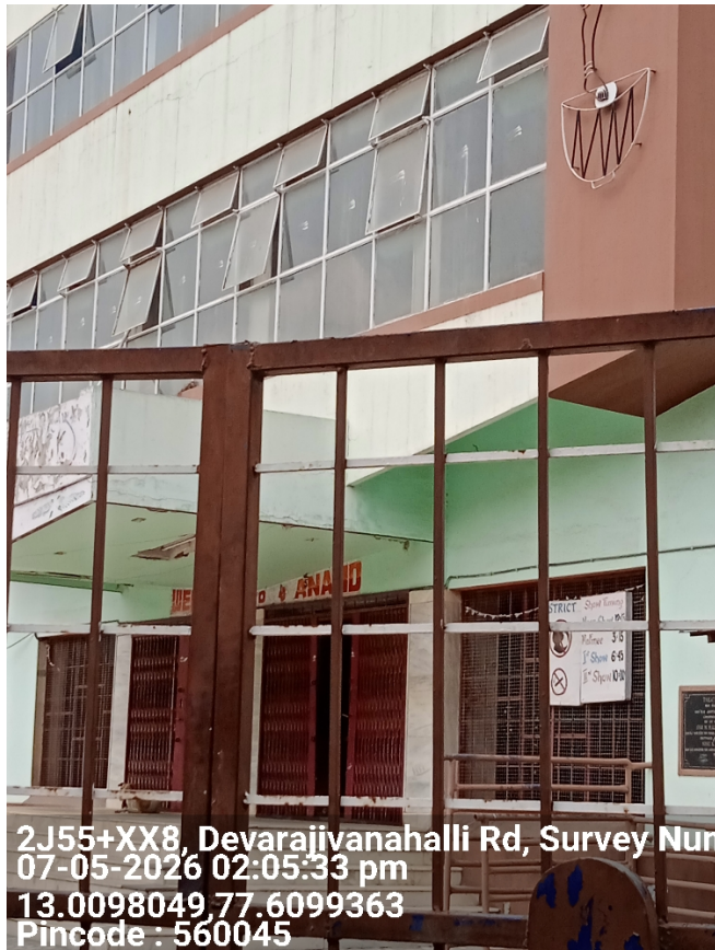
2J55+XX8, Devarajivanahalli Rd, Survey Num 07-05-2026 02:05:33 pm 13.0098049,77.6099363 Pincode : 560045

Shop inside with inventory photos establishing that the inside is of the same shop where the front photo was taken