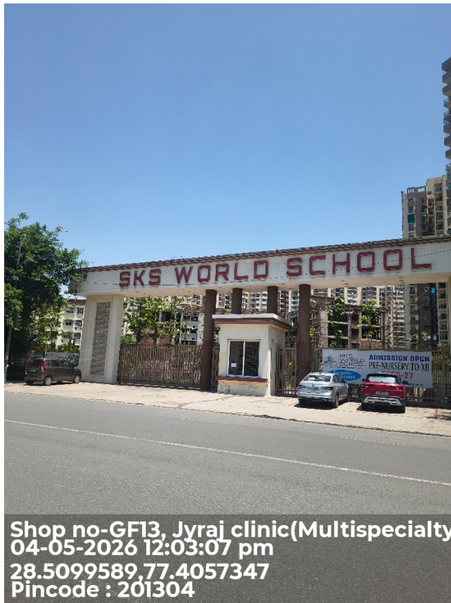
Shop no-GF13, Jyraj clinic(Multispecialty) 04-05-2026 12:03:07 pm 28.5099589,77.4057347 Pincode : 201304

Shop front with horizontal view covering the left & right of the shop establishing if the shop is an individual structure, in a marketplace, highway, isolated place, in a cluster framework.