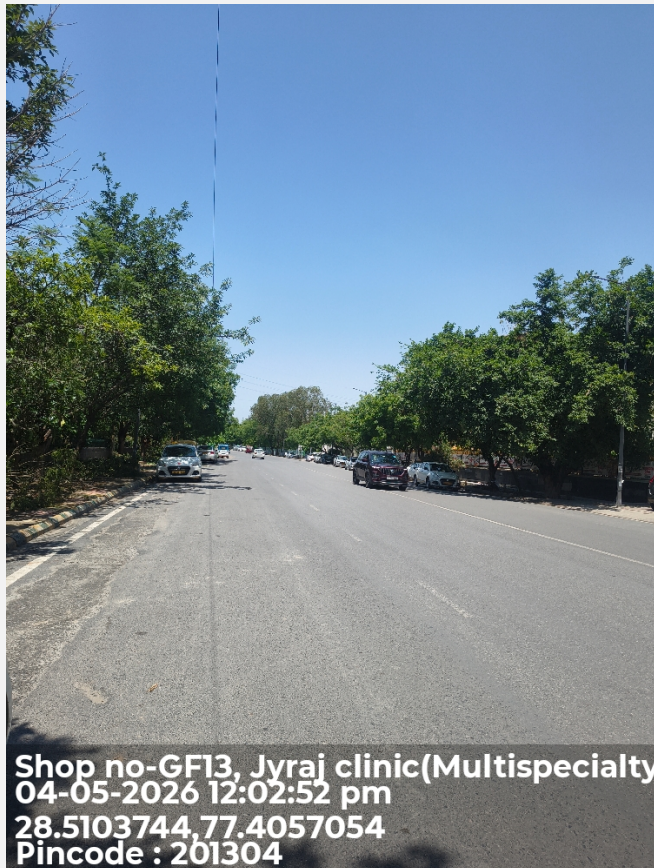
Shop no-GF13, Jyraj clinic(Multispecialty) 04-05-2026 12:02:52 pm 28.5103744,77.4057054 Pincode : 201304

Shop inside with inventory photos establishing that the inside is of the same shop where the front photo was taken