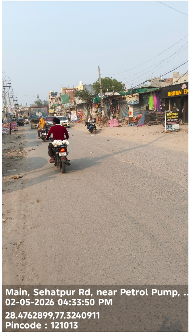
Main, Sehatpur Rd, near Petrol Pump, .. 02-05-2026 04:33:50 PM 28.4762899,77.3240911 Pincode : 121013

Shop inside with inventory photos establishing that the inside is of the same shop where the front photo was taken