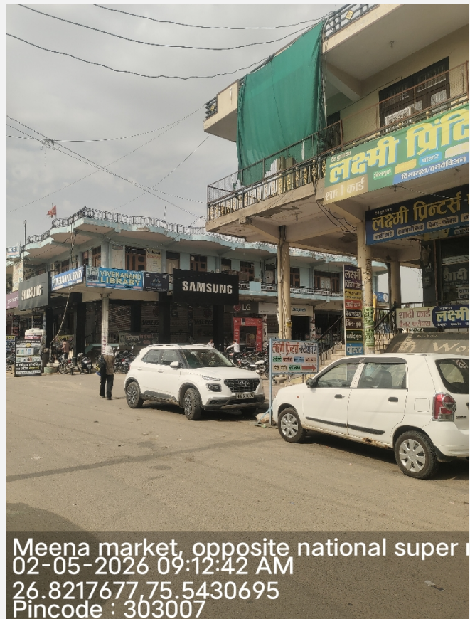
Meena market, opposite national super m 02-05-2026 09:12:42 AM 26.8217677,75.5430695 Pincode : 303007

Shop inside with inventory photos establishing that the inside is of the same shop where the front photo was taken