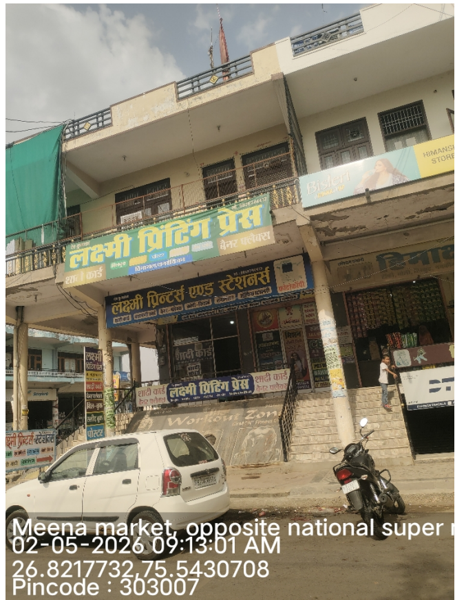
Meena market, opposite national super m 02-05-2026 09:13:01 AM 26.8217732,75.5430708 Pincode : 303007

Shop front with horizontal view covering the left & right of the shop establishing if the shop is an individual structure, in a marketplace, highway, isolated place, in a cluster framework.