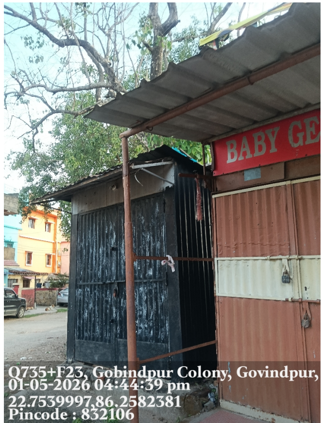
Photo with UPI Scanner