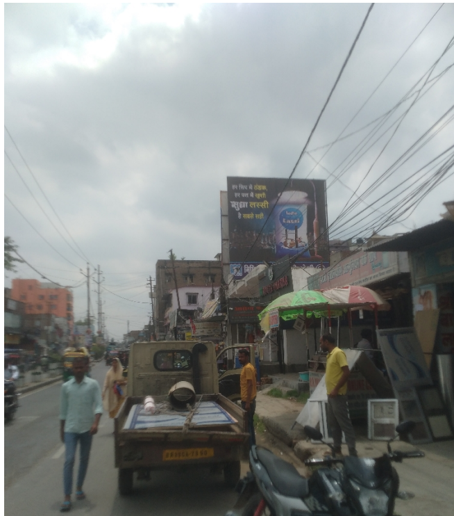
Life Imaging & Diagnostic Centre, near ... 30-04-2026 12:03:32 pm 25.8513017,85.7733308 Pincode : 848101

Shop inside with inventory photos establishing that the inside is of the same shop where the front photo was taken