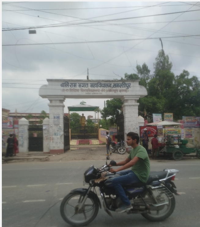
Life Imaging & Diagnostic Centre, near ... 30-04-2026 12:04:30 pm 25.8513085,85.7733203 Pincode : 848101

Shop front with horizontal view covering the left & right of the shop establishing if the shop is an individual structure, in a marketplace, highway, isolated place, in a cluster framework.