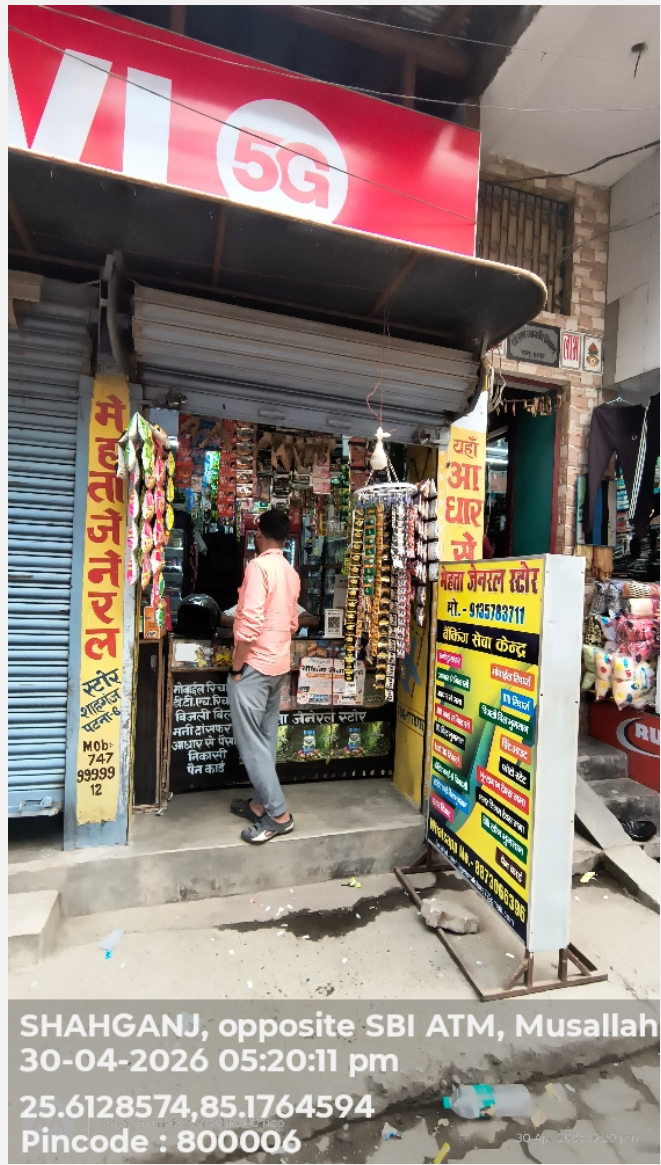
SHAHGANJ, opposite SBI ATM, Musallah 30-04-2026 05:20:11 pm 25.6128574,85.1764594 Pincode : 800006