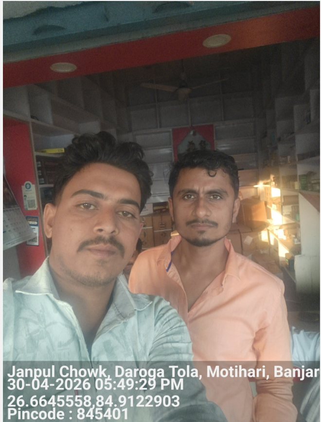
Photo with Agent

Janpul Chowk, Daroga Tola, Motihari, Banjar 30-04-2026 05:49:29 PM 26.6645558,84.9122903 Pincode : 845401