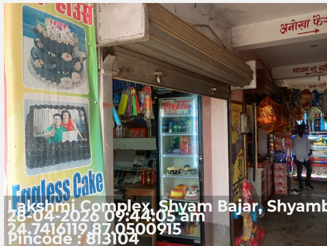
Photo of Outside Shop