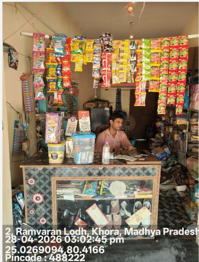
Photo of Outside Shop