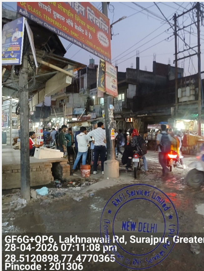
GF6G+QP6, Lakhnavi Rd, Surajpur, Greater 28-04-2026 07:11:08 pm 28.5120898, 77.4770365 Pincode : 201306