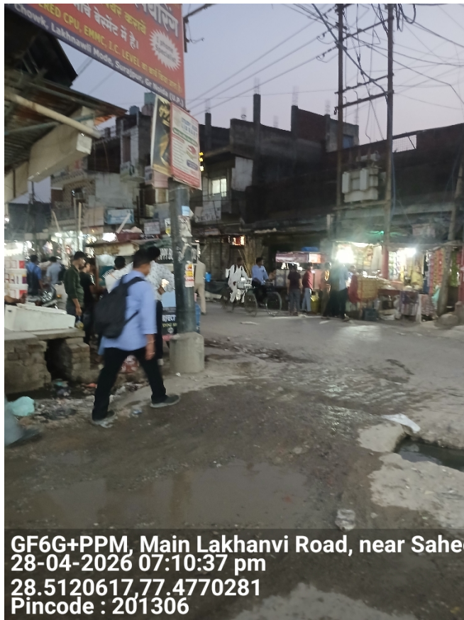
GF6G+PPM, Main Lakhnavi Road, near Sahe 28-04-2026 07:10:37 pm 28.5120617, 77.4770281 Pincode : 201306

Shop inside with inventory photos establishing that the inside is of the same shop where the front photo was taken