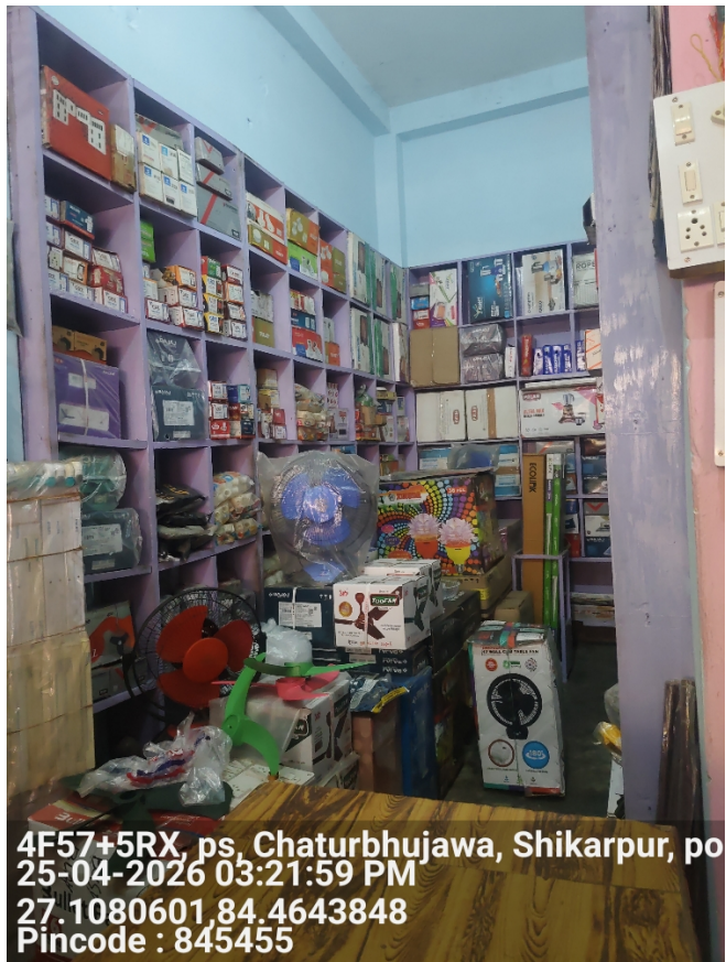
Photo of Machinery Setup

4F57+5RX, ps, Chaturbhujawa, Shikarpur, po 25-04-2026 03:21:59 PM 27.1080601,84.4643848 Pincode : 845455