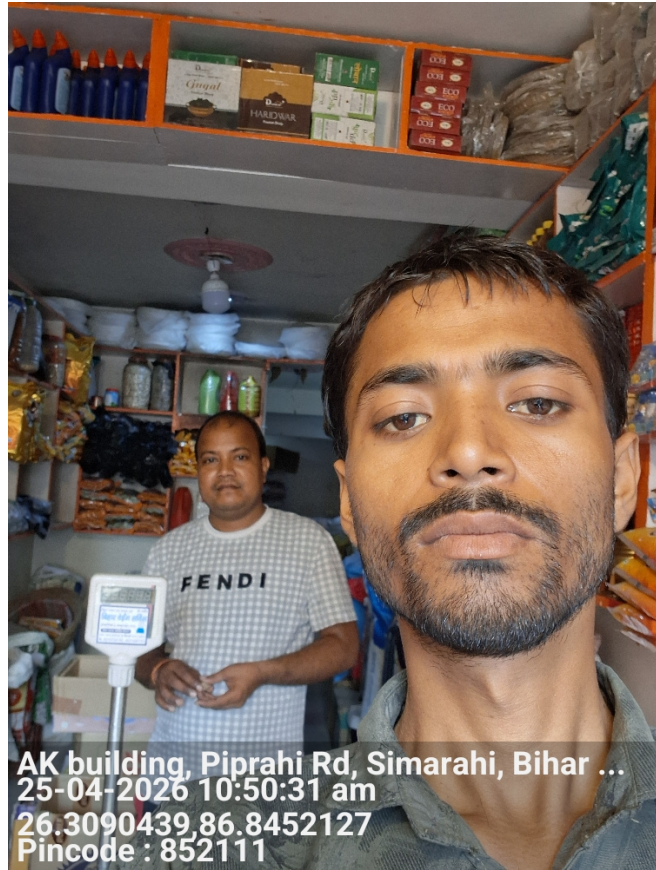
Photo with Agent

AK building, Piprahi Rd, Simarahi, Bihar ... 25-04-2026 10:50:31 am 26.3090439,86.8452127 Pincode : 852111