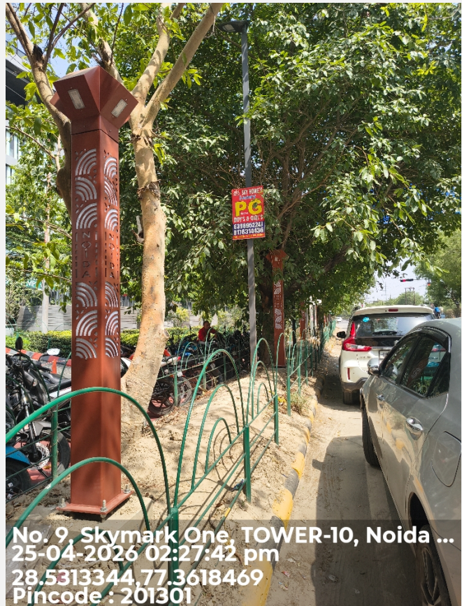
No. 9, Skymark One, TOWER-10, Noida ... 25-04-2026 02:27:42 pm 28.5313344,77.3618469 Pincode : 201301

Shop inside with inventory photos establishing that the inside is of the same shop where the front photo was taken