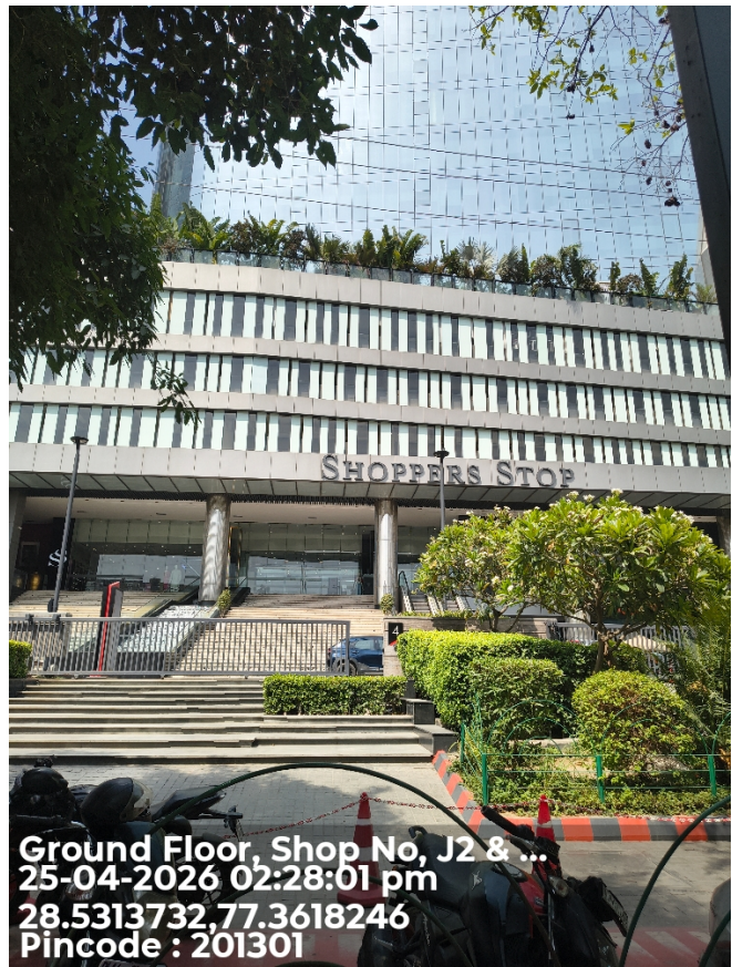
Ground Floor, Shop No, J2 & ... 25-04-2026 02:28:01 pm 28.5313732,77.3618246 Pincode : 201301

Shop front with horizontal view covering the left & right of the shop establishing if the shop is an individual structure, in a marketplace, highway, isolated place, in a cluster framework.