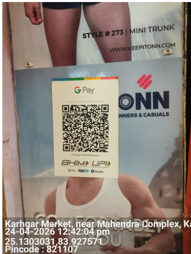
Photo with UPI Scanner

Karhgar Market, near Mahendra Complex, Ka 24-04-2026 12:42:04 pm 25.1303031,83.927571 Pincode : 821107