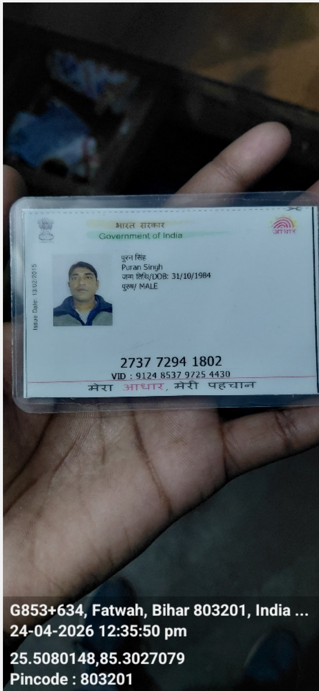
Photo of ID Proof