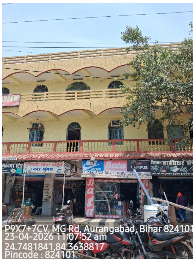
Photo with Agent