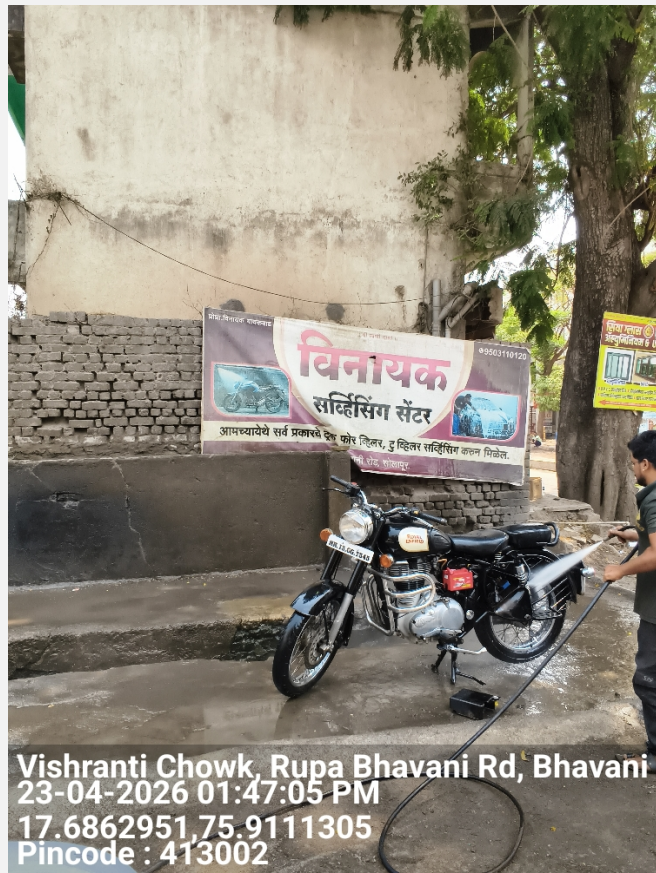
Vishranti Chowk, Rupa Bhavani Rd, Bhavani 23-04-2026 01:47:05 PM 17.6862951,75.9111305 Pincode : 413002

Shop front photo with full vertical viewpoint i.e; shop board, sealing, entrance, ground on which the shop is established (cemented, pilers, bricks, stands, mud, wheels etc.)