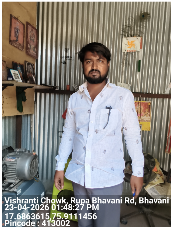
Vishranti Chowk, Rupa Bhavani Rd, Bhavani 23-04-2026 01:48:27 PM 17.6863615,75.9111456 Pincode : 413002

Take Photo of Person Met Inside the Shop