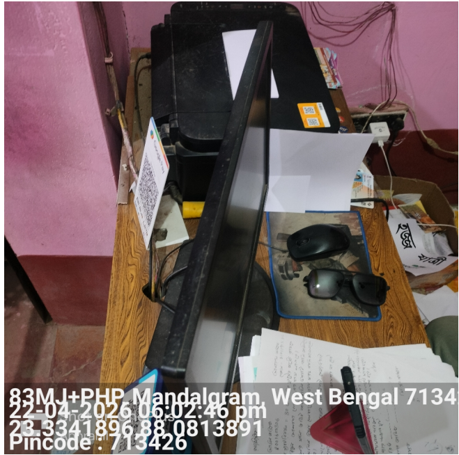
Photo of Machinery Setup