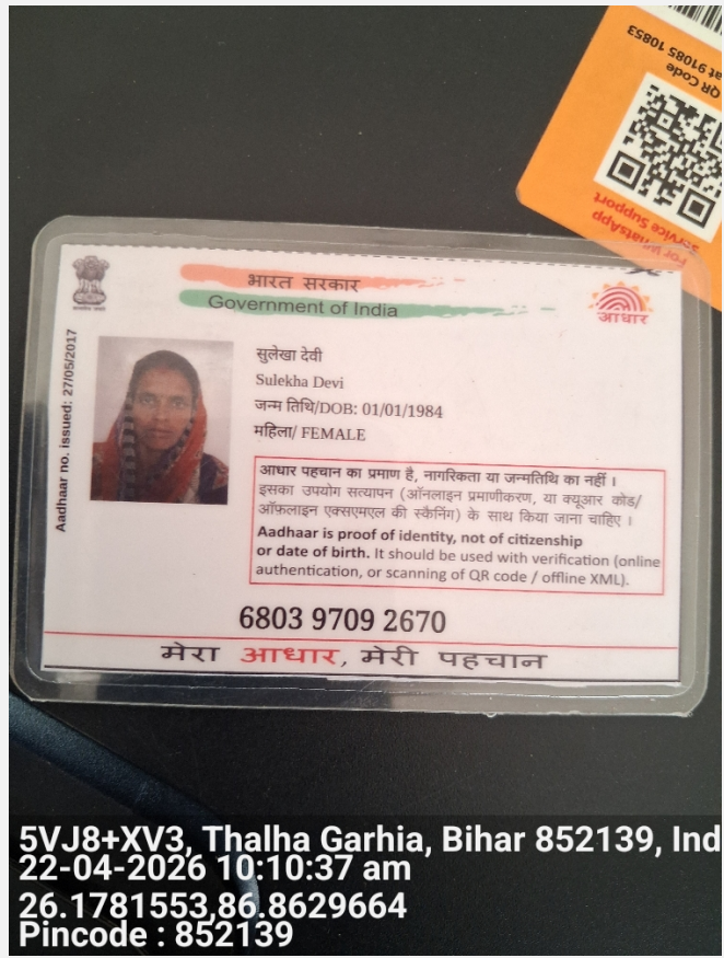
Photo of ID Proof