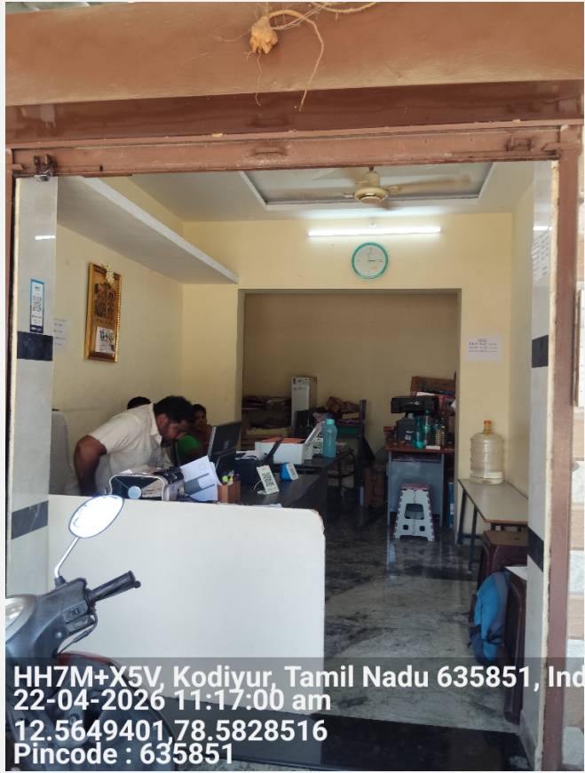
Photo of Outside Shop