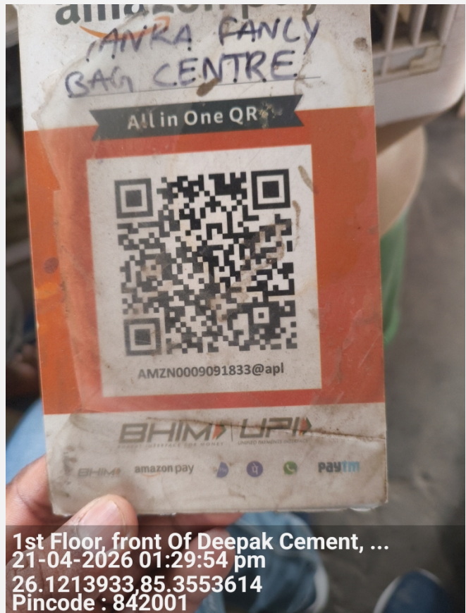
Photo with UPI Scanner