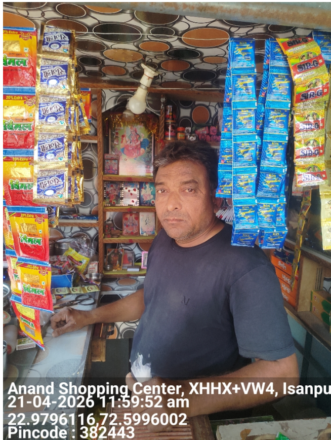
Anand Shopping Center, XHHX+VW4, Isanpu 21-04-2026 11:59:52 am 22.9796116,72.5996002 Pincode : 382443

Take Photo of Person Met Inside the Shop