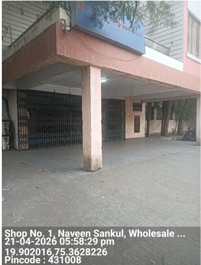
Shop No. 1, Naveen Sankul, Wholesale ... 21-04-2026 05:58:29 pm 19.902016,75.3628226 Pincode : 431008

Shop inside with inventory photos establishing that the inside is of the same shop where the front photo was taken