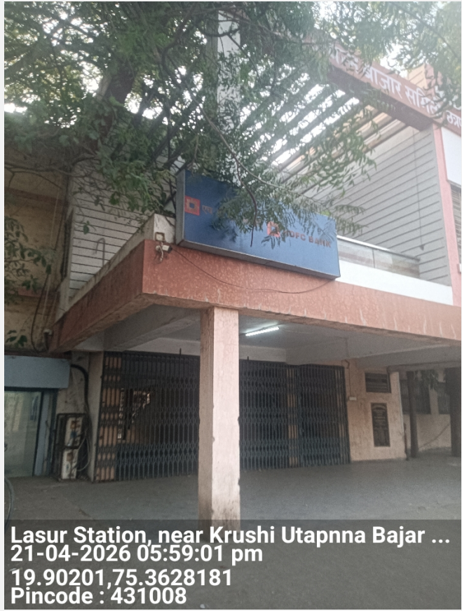
Lasur Station, near Krushi Utapnna Bajar ... 21-04-2026 05:59:01 pm 19.90201,75.3628181 Pincode : 431008

Shop front with horizontal view covering the left & right of the shop establishing if the shop is an individual structure, in a marketplace, highway, isolated place, in a cluster framework.