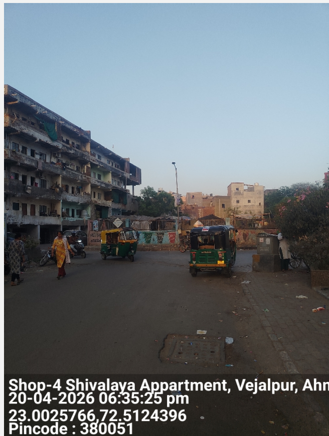
Shop-4 Shivalaya Appartment, Vejalpur, Ahm 20-04-2026 06:35:25 pm 23.0025766,72.5124396 Pincode : 380051

Take Photo of Person Met Inside the Shop