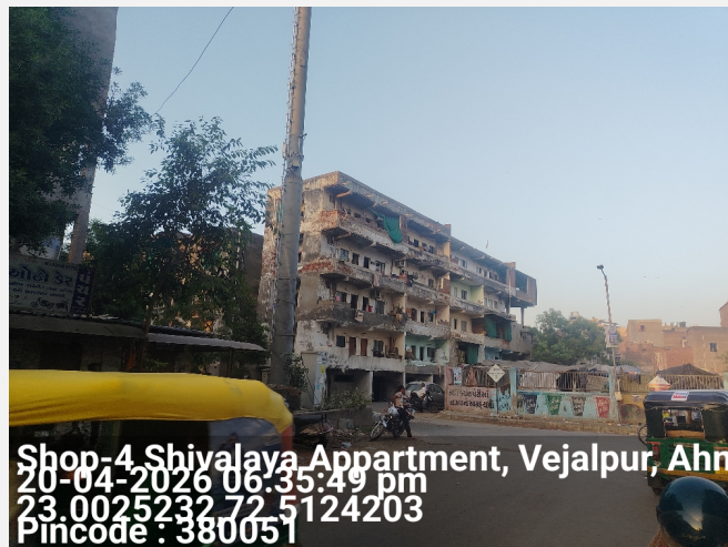
Shop-4, Shivalaya Appartment, Vejalpur, Ahm 20-04-2026 06:35:49 pm 23.0025232,72.5124203 Pincode : 380051

Shop front with horizontal view covering the left & right of the shop establishing if the shop is an individual structure, in a marketplace, highway, isolated place, in a cluster framework.