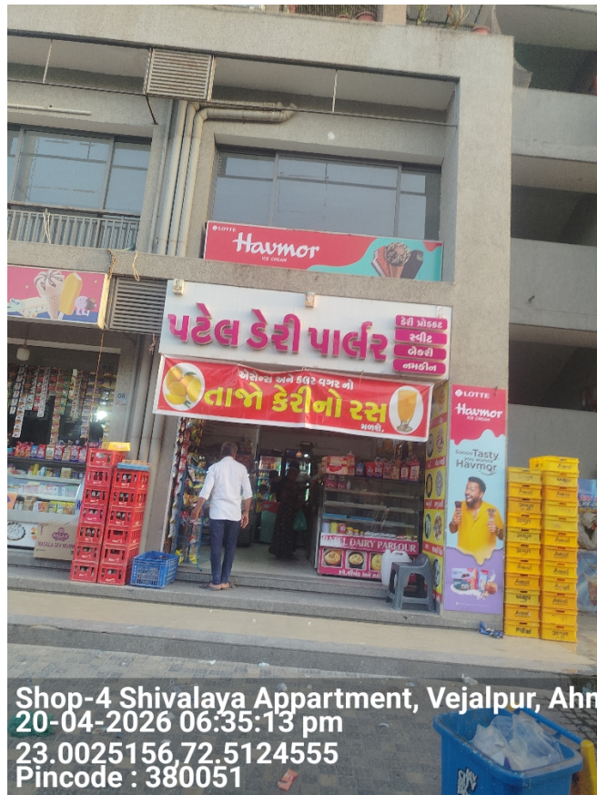
Shop-4 Shivalaya Appartment, Vejalpur, Ahm 20-04-2026 06:35:13 pm 23.0025156,72.5124555 Pincode : 380051

Shop front photo with full vertical viewpoint i.e; shop board, sealing, entrance, ground on which the shop is established (cemented, pilers, bricks, stands, mud, wheels etc.)