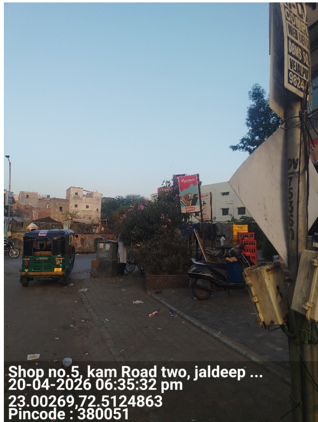
Shop no.5, kam Road two, jaldeep ... 20-04-2026 06:35:32 pm 23.00269,72.5124863 Pincode : 380051

Take Photo of QR Code/Soundbox/EDC Machine