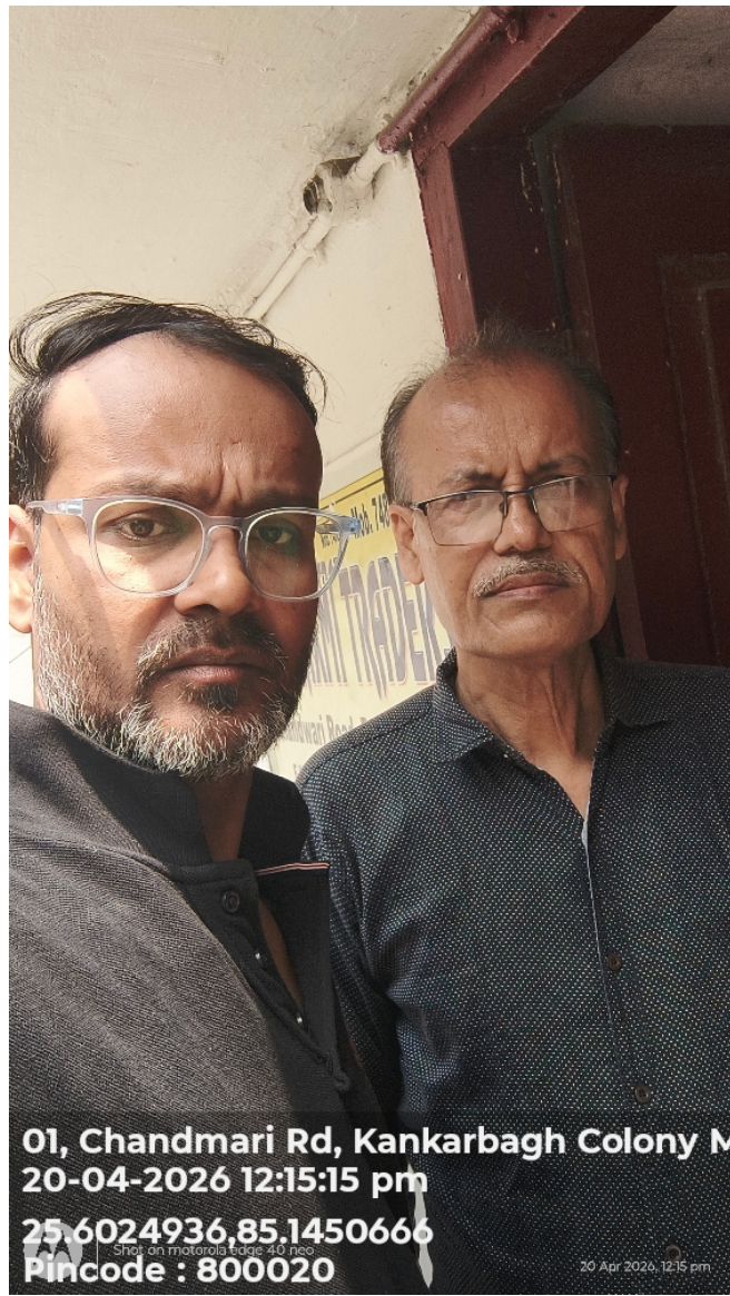
Photo with Agent