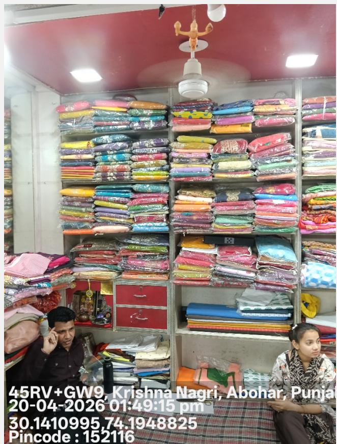
Photo of Stock