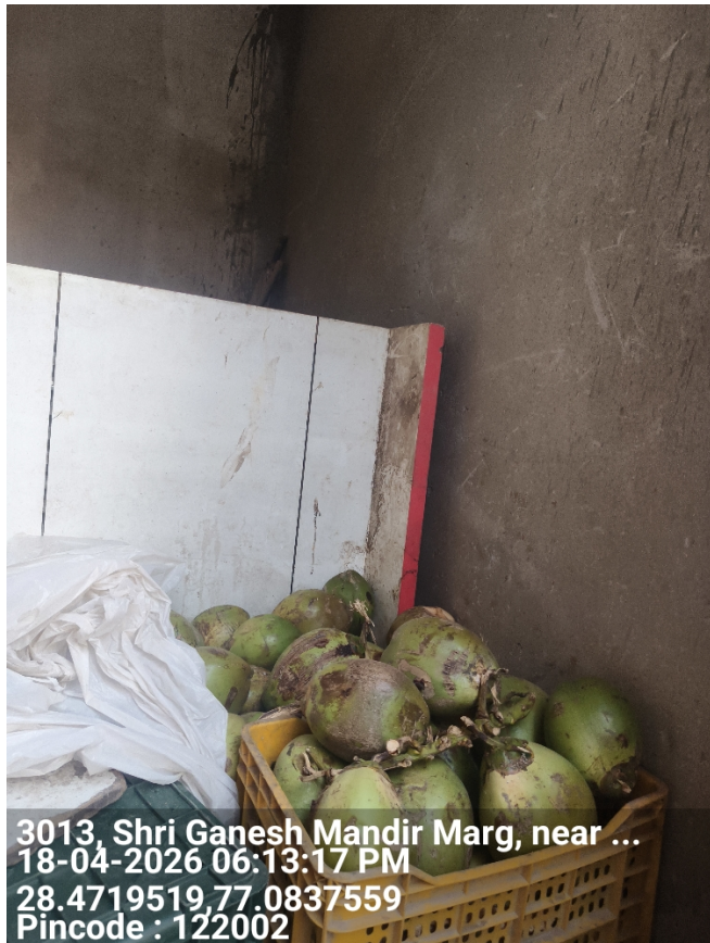
3013, Shri Ganesh Mandir Marg, near ... 18-04-2026 06:13:17 PM 28.4719519,77.0837559 Pincode : 122002

Shop inside with inventory photos establishing that the inside is of the same shop where the front photo was taken