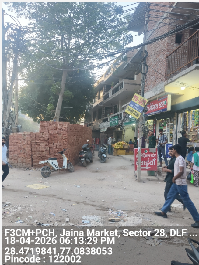
F3CM+PCH, Jaina Market, Sector 28, DLF ... 18-04-2026 06:13:29 PM 28.4719841,77.0838053 Pincode : 122002

Shop front with horizontal view covering the left & right of the shop establishing if the shop is an individual structure, in a marketplace, highway, isolated place, in a cluster framework.