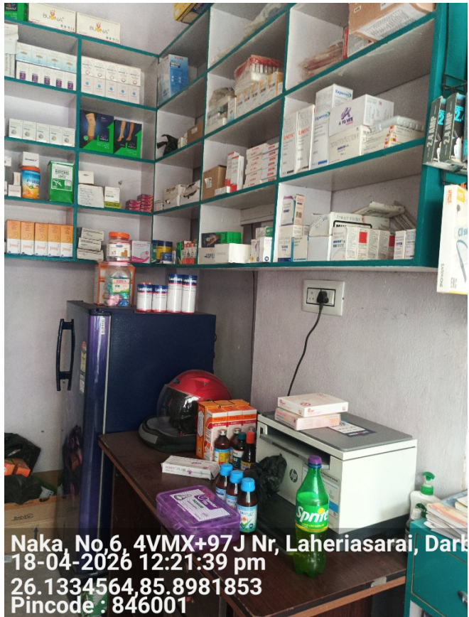
Photo of Machinery Setup