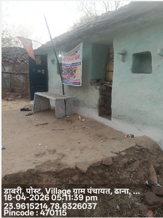
Photo of Outside Shop