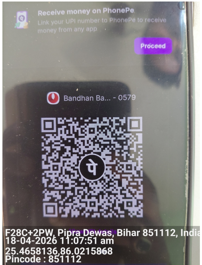
Photo with UPI Scanner