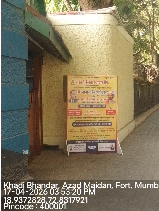
Khadi Bhandar, Azad Maidan, Fort, Mumbai 17-04-2026 03:53:20 PM 18.9372828,72.8317921 Pincode : 400001

Shop front photo with full vertical viewpoint i.e; shop board, sealing, entrance, ground on which the shop is established (cemented, pilers, bricks, stands, mud, wheels etc.)