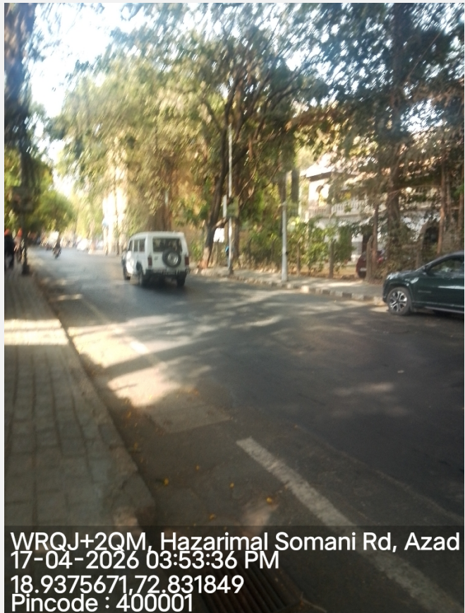
WRQJ+2QM, Hazarimal Somani Rd, Azad 17-04-2026 03:53:36 PM 18.9375671,72.831849 Pincode : 400001

Take Photo of Person Met Inside the Shop