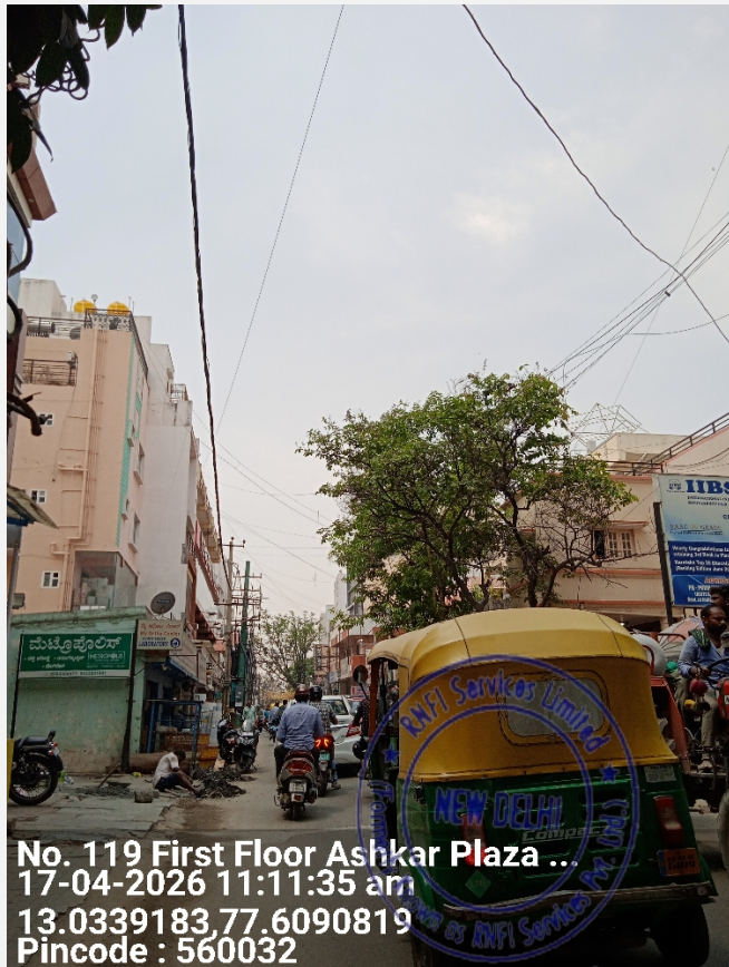
No. 119 First Floor Ashkar Plaza ... 17-04-2026 11:11:35 am 13.0339183,77.6090819 Pincode : 560032