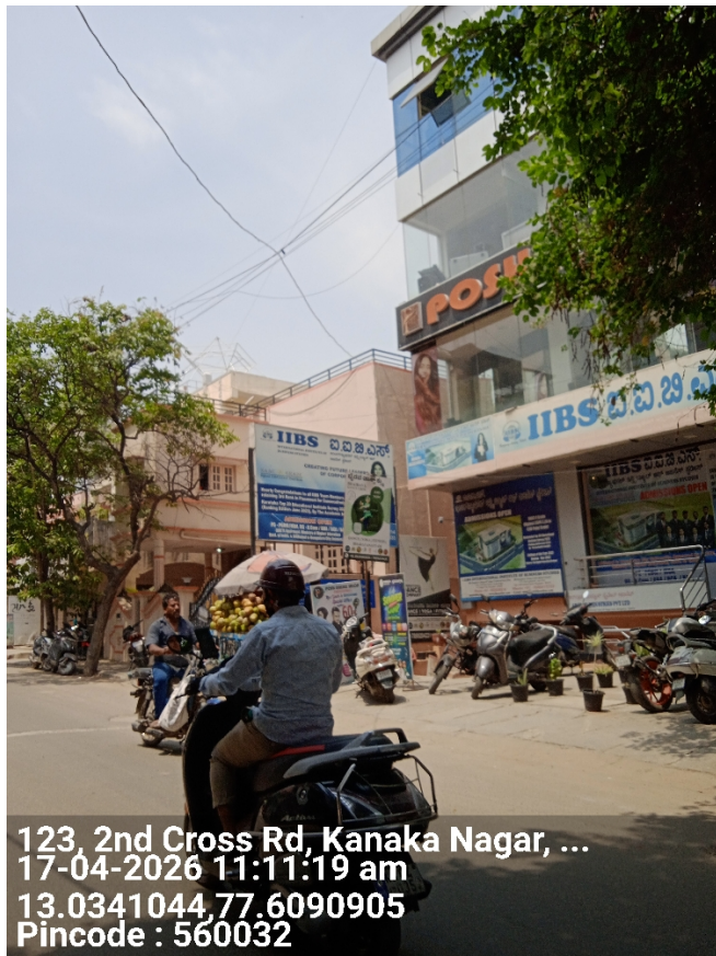
123, 2nd Cross Rd, Kanaka Nagar, ... 17-04-2026 11:11:19 am 13.0341044,77.6090905 Pincode : 560032

Shop inside with inventory photos establishing that the inside is of the same shop where the front photo was taken