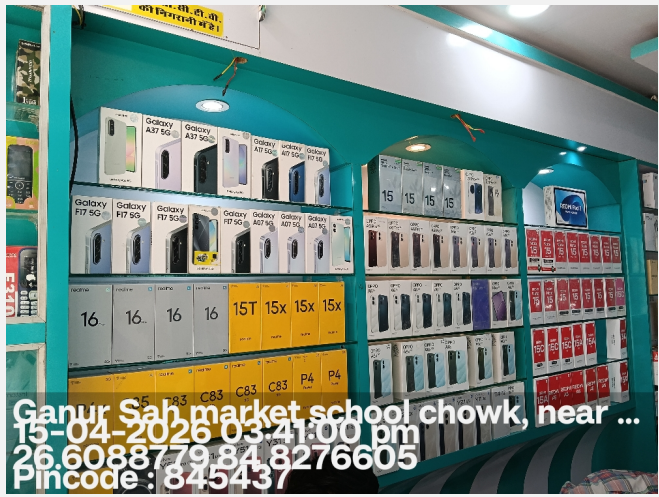
Photo of Stock