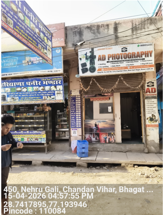
Photo with UPI Scanner

450, Nehru Gali, Chandan Vihar, Bhagat ... 15-04-2026 04:57:55 PM 28.7417895,77.193946 Pincode : 110084