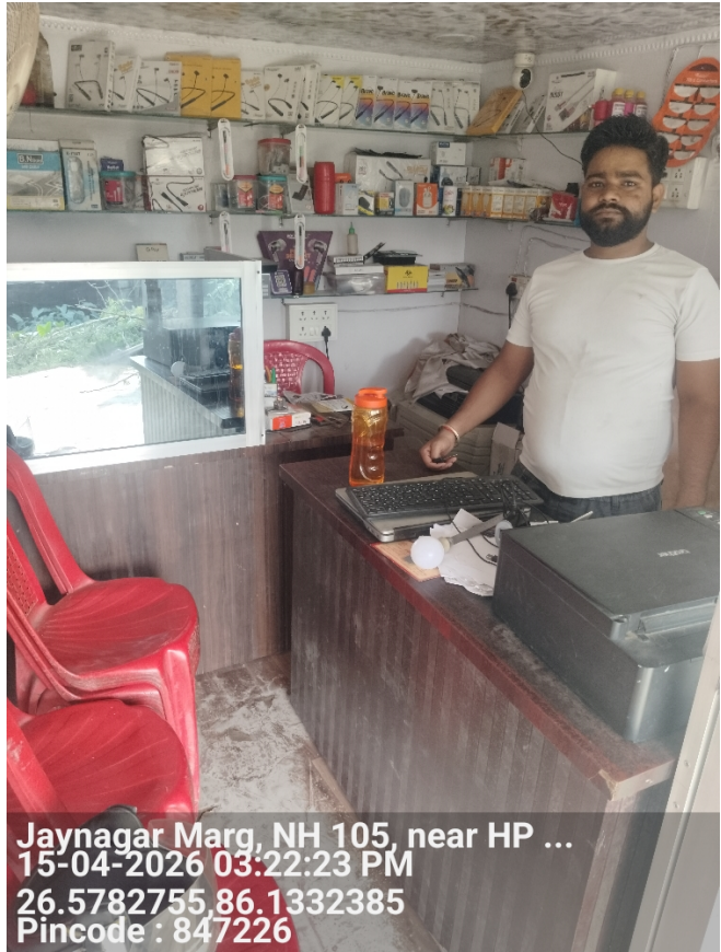
Photo of Machinery Setup