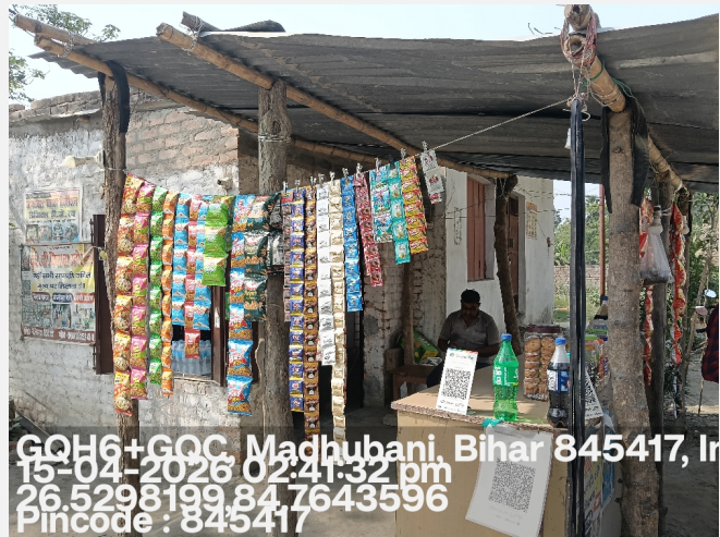
Photo of Outside Shop