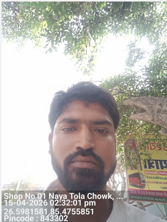
Photo of Outside Shop