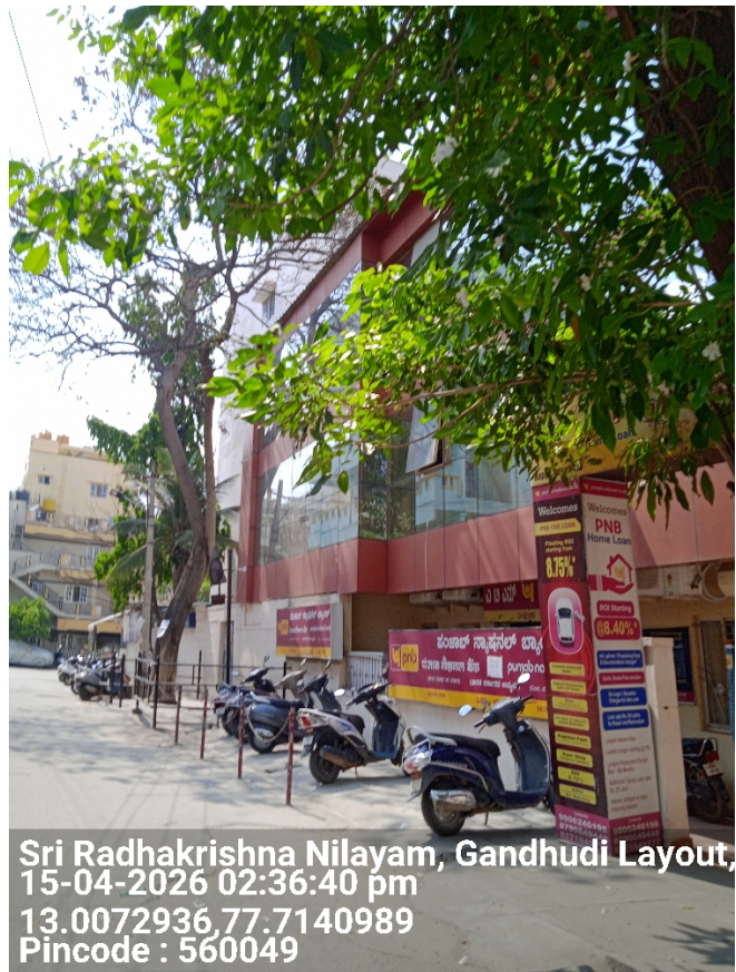
Sri Radhakrishna Nilayam, Gandhudi Layout, 15-04-2026 02:36:40 pm 13.0072936,77.7140989 Pincode : 560049

Shop front photo with full vertical viewpoint i.e; shop board, sealing, entrance, ground on which the shop is established (cemented, pilers, bricks, stands, mud, wheels etc.)