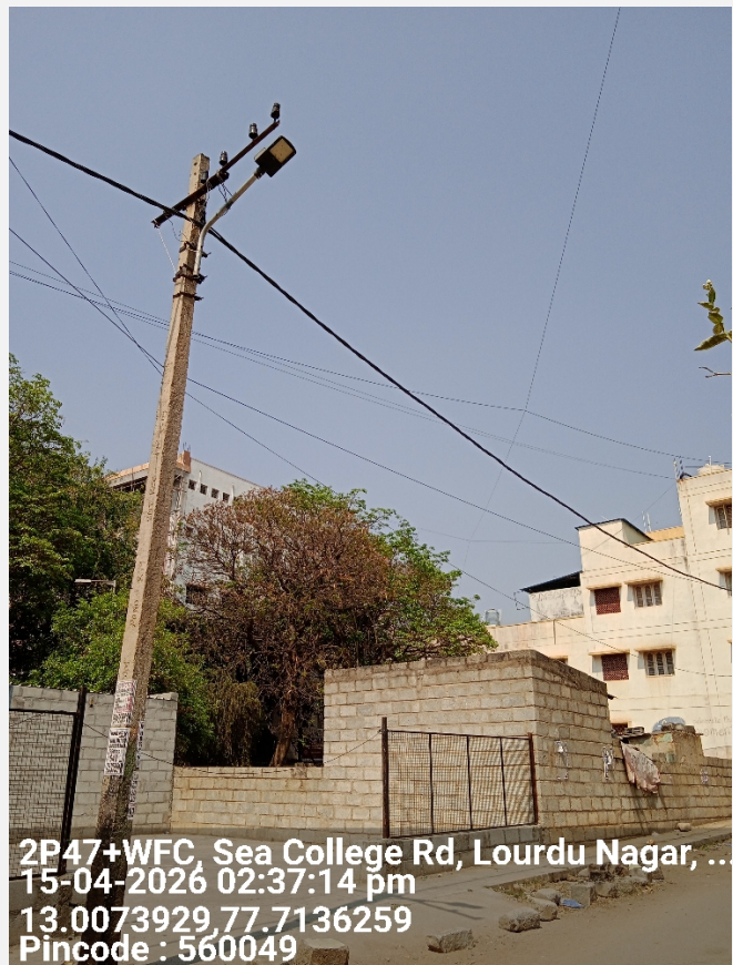
2P47+WFC, Sea College Rd, Lourdu Nagar, .. 15-04-2026 02:37:14 pm 13.0073929,77.7136259 Pincode : 560049

Take Photo of Person Met Inside the Shop